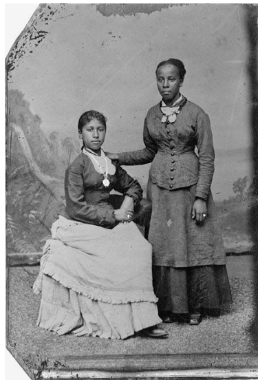
Women who acted as spies during Civil War