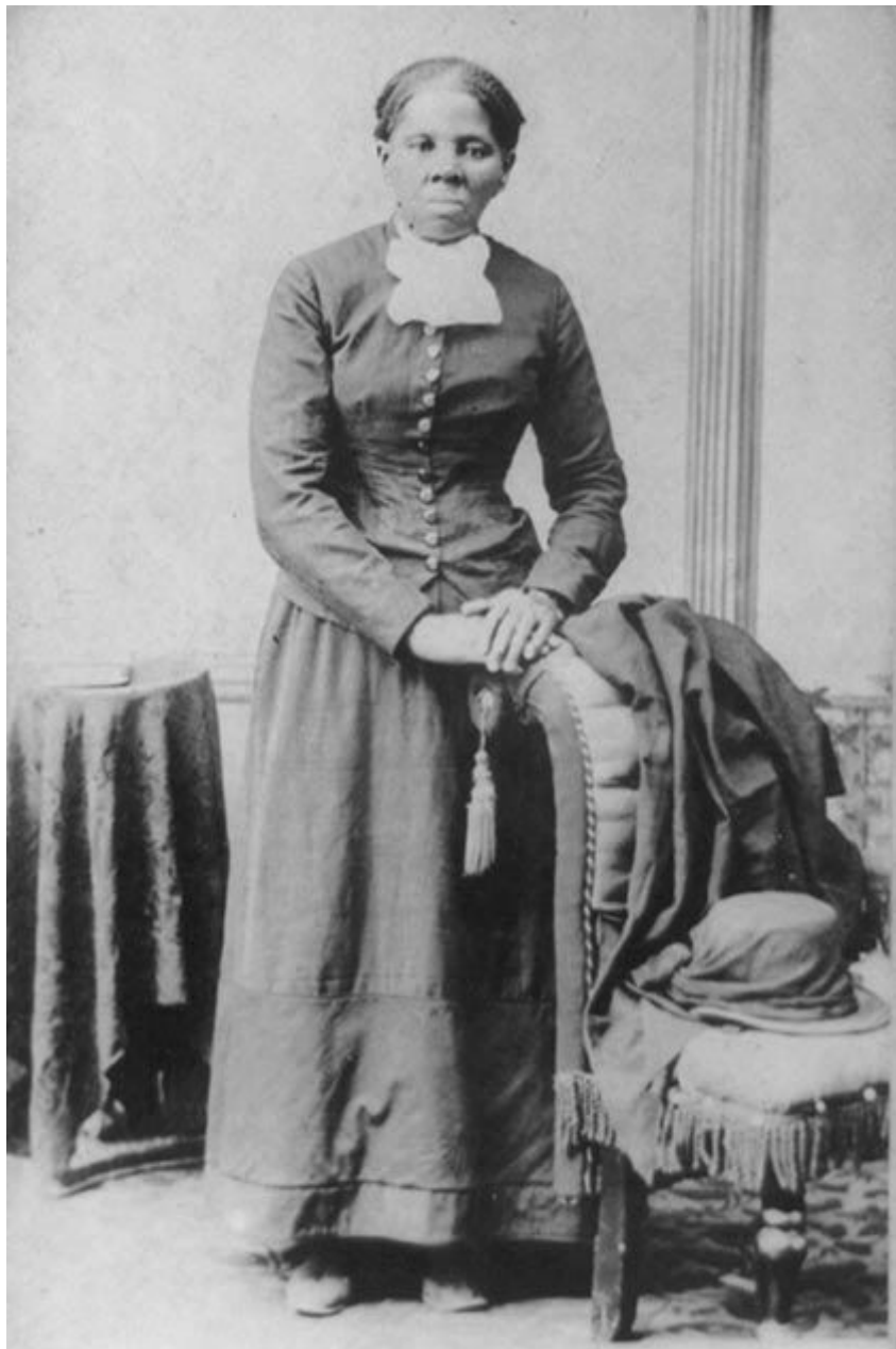
Harriet Tubman who serves as a spy for Northern Army