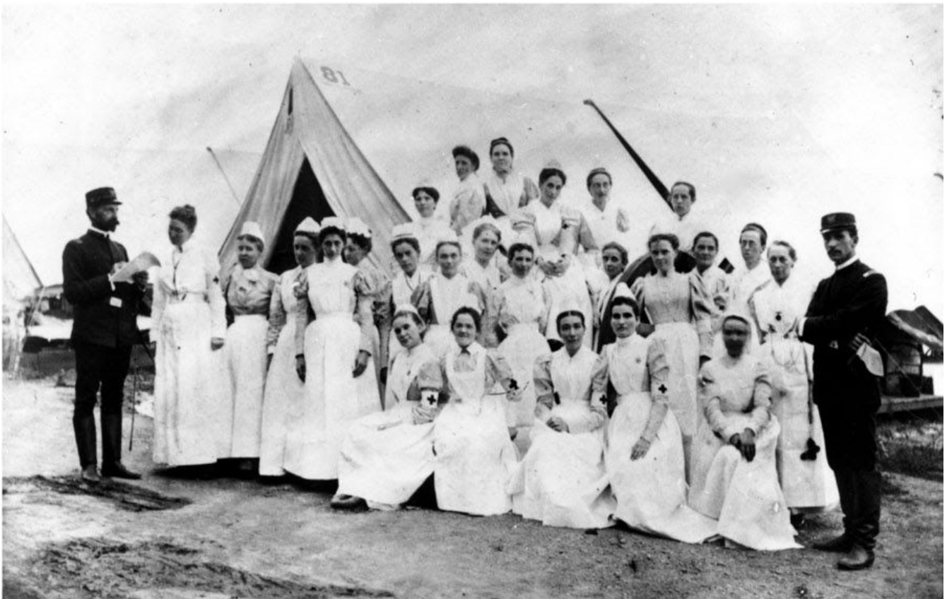
Nurses at a war camp hospital

What can photographs of the Civil War tell us about the conflict and developments in the documentation of war?