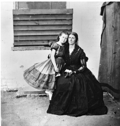
Mother and Daughter

ability to use context clues to define unknown words due to rich language in this module’s resources. In both core texts, students are exposed to a variety of points of view which enrich their experience with the text as they learn to consider how a point of view impacts the way events are described.”-Wit & Wisdom